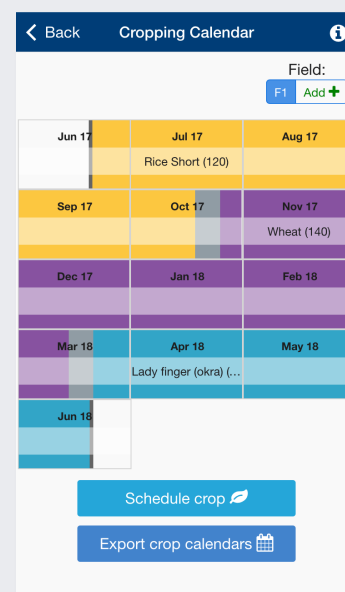
Figure 1: The DSI4MTF Applets portal contains a growing number of prototype apps. An example of an applet (above) is the Cropping Calendar, which allows farmers to investigate potential cropping rotations based on the planting of paddy and the remaining cropping days in a given year