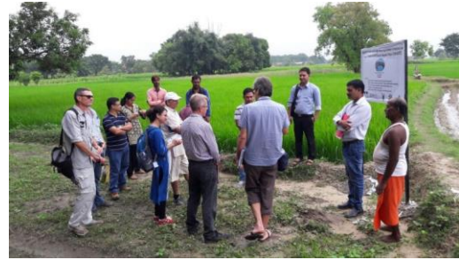
Discussions at demonstration site on project activities

Of particular importance is communicating with farmers and broader stakeholders the outcomes and impact of project activities.