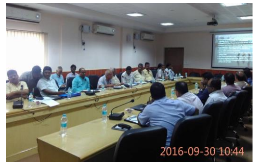
Stakeholder engagement meeting Patna September 2016

The strong interdisciplinary science focus of the project was also recognised.