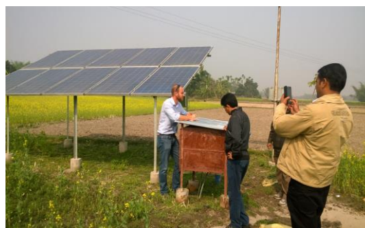
Solar pumping demonstration systems – West Bengal