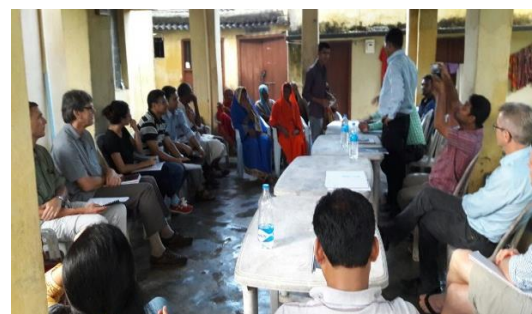
Meeting with farmer groups Bhagwatipur